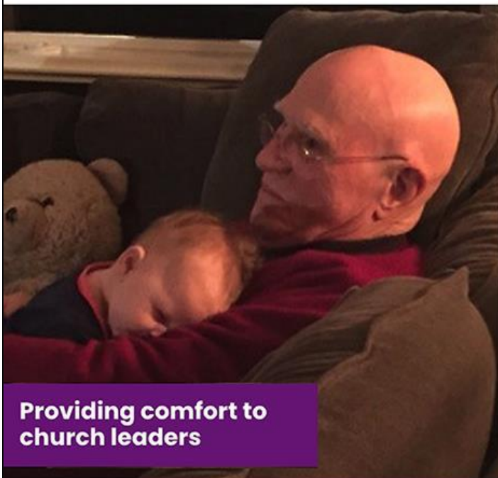
Providing comfort to church leaders

God has blessed the Church with incredible leadership in every time and place, but those leaders often need to be supported by their communities as well. This Offering addresses the support needed by some of our leaders, including supporting leadership development for communities of color, and providing support for Presbyterian church workers in their time of need.