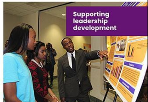
Supporting leadership development