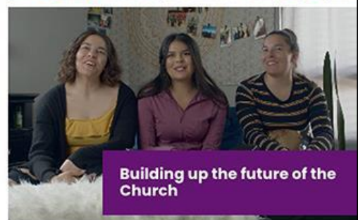
Building up the future of the Church